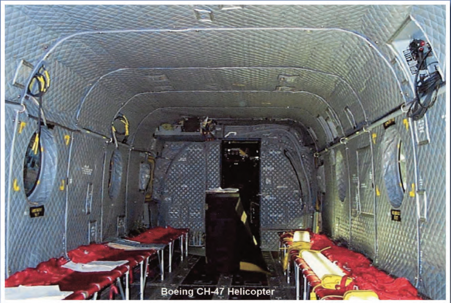
Boeing CH-47 Helicopter

Maximize sound control and noise reduction.